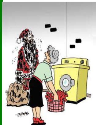
" THIS BUSINESS OF ENTERING PEOPLE'S HOUSES THROUGH THE CHIMNEY HAS GOT TO STOP! "