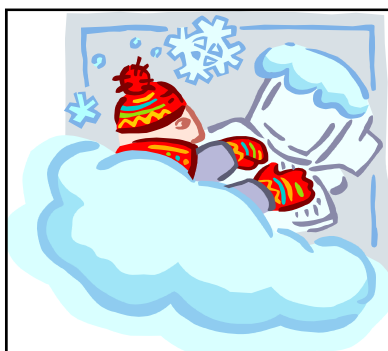
Nollaig Shona Dhuit

Monday 2nd February to Friday 13th inclusive.